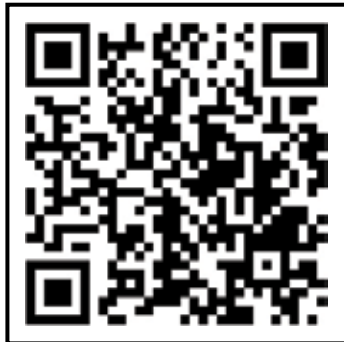
Book Fair Payment