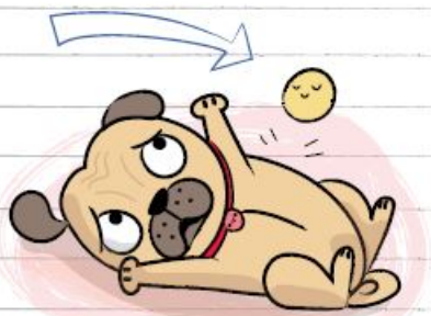
Have to Go Out Face