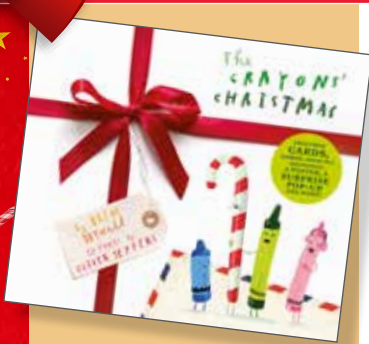
THE CRAYONS' CHRISTMAS BOOK CLUB #565

MAKE REINDEER CHRISTMAS CARDS. TEACHER ESSENTIALS #829