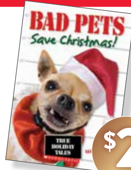
BAD PETS SAVE CHRISTMAS! BOOK CLUB #301